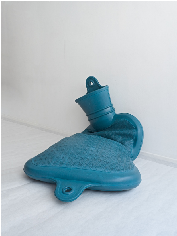
Macro XI, 2013

Art Exhibition By Camille | January 30, 2014