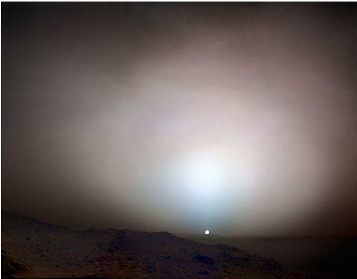
Sunset on Mars, Spirit Rover, May 19, 2005, 2012

infrared filters, in which case you can mix the green and infrared to in effect pull the red data back into the visible spectrum.