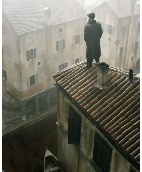
Paolo Ventura, The Automaton #15 , 2010

Paolo Ventura's creative process for The Automaton of Venice was first to write the story as he wanted to tell it through the photographs. He then builds elaborate models in his studio out of sets and miniature figurines. The final works are the photographs of the scenes created within the models. The Automaton of Venice is a photographic narrative from beginning to end. Five photographs from Ventura's newest body of work, Behind the Walls , will also be exhibited.