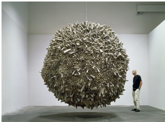
Kwang Young Chun, Aggregation 03-BJ001 , 2003, 11.5 feet in diameter.